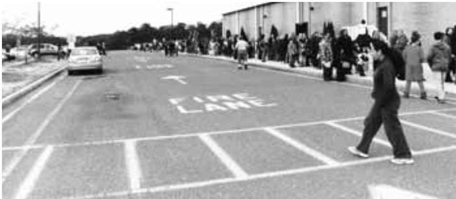
Students await the opening of the Interact Halloween Party